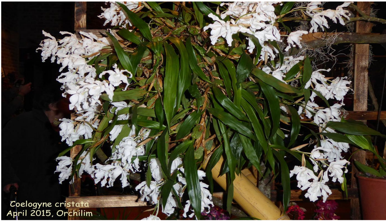
(Not George's plant)

The "Members Choice " plant is Coelogyne cristata var. alba and had 96 flowers . It was purchased from J and L nursery in 2005 as a small plant. Since then it has grown into 2 large specimens . The plant shown at the meeting is growing in a large clay pot in a bark mix. Most of the year it is gown in a cool greenhouse in good light and kept drier in the winter. In summers the plants are outside on the east side of my house and watered more often . I use R. O. water and fertilize with MSU pure water during active growth The species is native to the eastern Himalayan mountains to Vietnam..... George